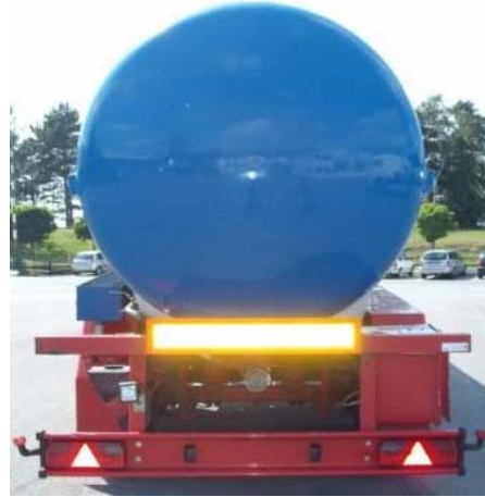
Figure 2; Tank-vehicle with underrun protection and rear protection

Thus, it is possible that tank-vehicles are equipped with a variety of different means of protection at their rear.