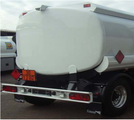
Figure 1: Vehicle with underrun protection

According to the wording of the text, the tank must be protected over its full width. This objective is to be achieved by way of a sufficiently resistant bumper. However, no performance parameter is specified or required by ADR along with the attribute “sufficiently resistant”. This results in room for interpretation regarding the strength of the section and its installation. The vertical position is not specified either. Therefore, in practice, it is often possible to “replace” the requirements for the rear protection prescribed by ADR – whose function it is to protect the tank from failing – and the underrun protection required by the German Road Traffic Registration Regulations by a stand-alone underrun protection. Thus, the underrun protection also functions as rear protection (see Figure 1). It is also possible to meet the statutory requirements of ADR by installing a separate rear protection, as shown in Figure 2.