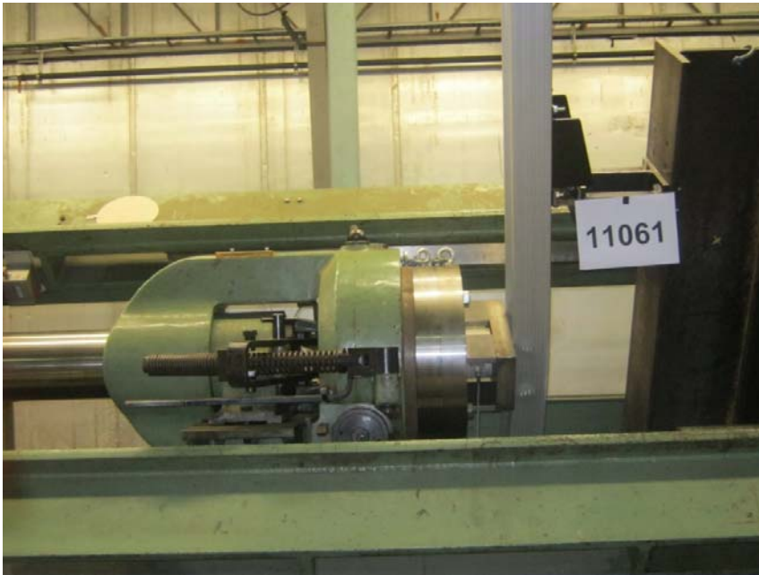
Figure 3: Tension-compression testing machine with aluminium underrun protection and end support

In the tests, the force applied by the testing machine was recorded along the distance. A maximum distance of 120 mm was selected so as to ensure that the required 100 mm distance between tank wall and rear protection was captured. A force transducer from Hottinger Baldwin Messtechnik (HBM) – model C6A – with a maximum nominal force of 5 MN (...) was used to record the force. It is capable of recording within a realistic measuring range.