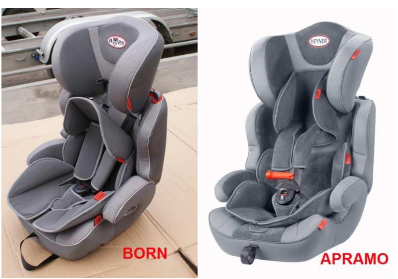
Figure 2: Apramo genuine seat and its copy

The Apramo company has a problem where one of their seats has been copied. This has an E4 certificate, the E4 number is 045013. Their distributor "Heyner" found a copy of the seat "BORN" in the German market, and now he offers the pictures of that seat. It looks extremely similar to the Group 123 seat from Apramo except for the headrest adjust mechanism on the back of headrest (Figure 2 and 3). Apramo applied for a patent including headrest adjust mechanism and seat contour last year, and the application was accepted by China Patent Buro.