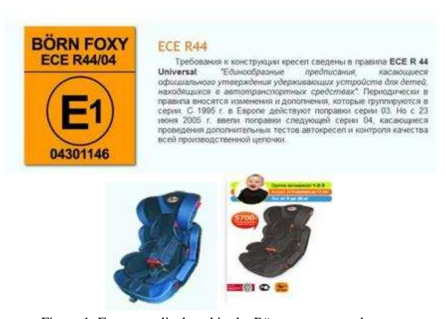
Figure 1: Foxy seat displayed in the Börn company web page

1. False use of a certification label: found on Russian website – company Börn They use the Baby Safe Infant Carrier Seat approval no. E1 04301146 from Britax Römer in their web page (<a href="http://www.born-sitz.ru/3in1.html">http://www.born-sitz.ru/3in1.html</a>, at to the bottom of the page), with the name of their seat Foxy on the approval ECE 44 label as shown in Figure 1. The label is false as it says that the Foxy child seat from company Börn was approved in Germany by KBA Authority (false statement) under the approval number (another false statement) which belongs to Britax Römer. Britax Römer has talked to KBA and learned that the use of the KBA logo, by Börn, was unauthorised, according to §5.2 of Regulation 44.