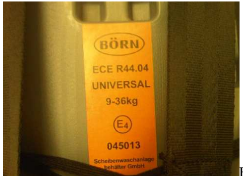
Figure 3: Details of Apramo seat genuine back and