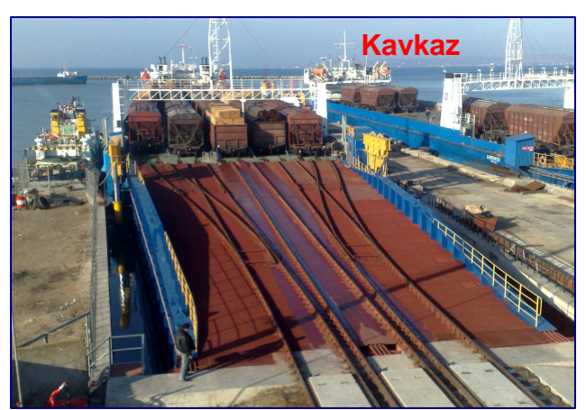
What is provided by this project?