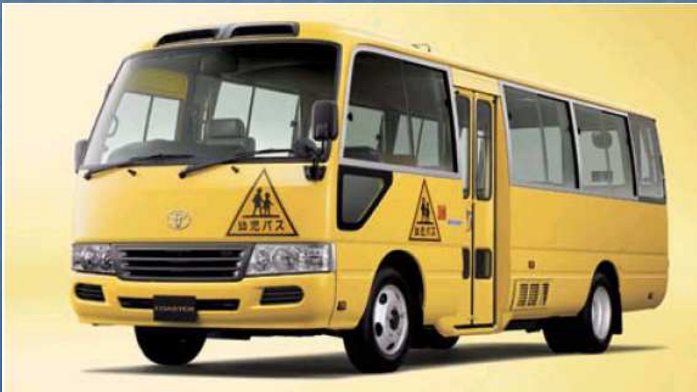
Figure1. Infant-carrying vehicle in Japan