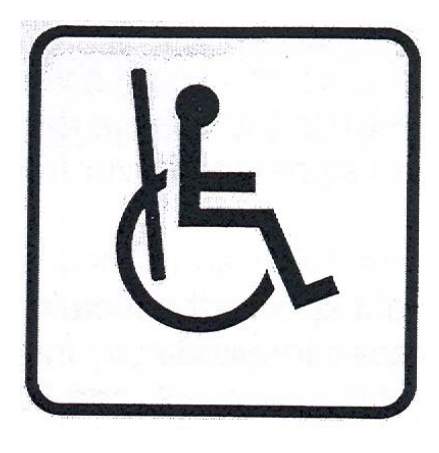
Figure 1 — Pictogram for wheelchair passenger space