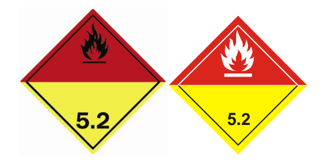
"(No. 5.2) Symbol (flame): black or white; Background: upper half red; lower half yellow; Figure "5.2" in bottom corner".

Replace label No. 5.2 and the text under the label with the following: