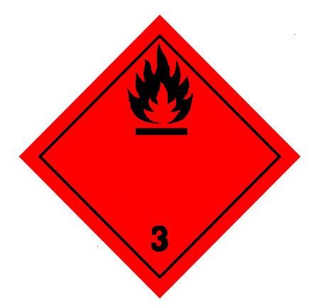
UN Number Proper shipping name