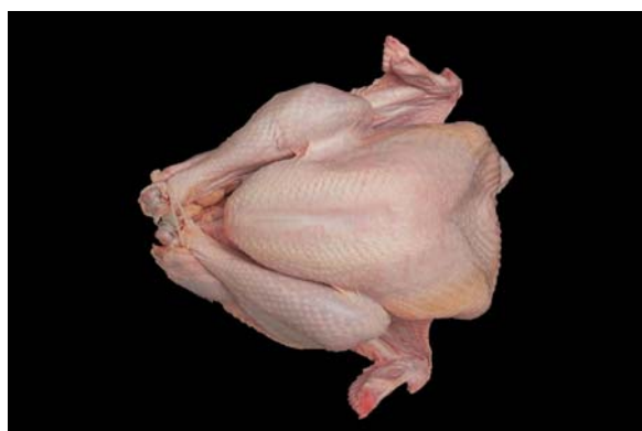
Figure 1: Whole Bird with Skin