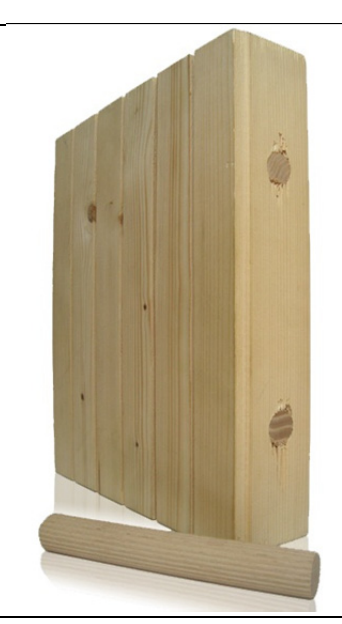
Notes: "Brettstapel" board; the plies are held together through long kiln-dried plugs made of beech which are inserted into pre-drilled holes; as soon as they absorb the moisture from the environment they swell leading to a strong bond between the different wooden parts of the board.