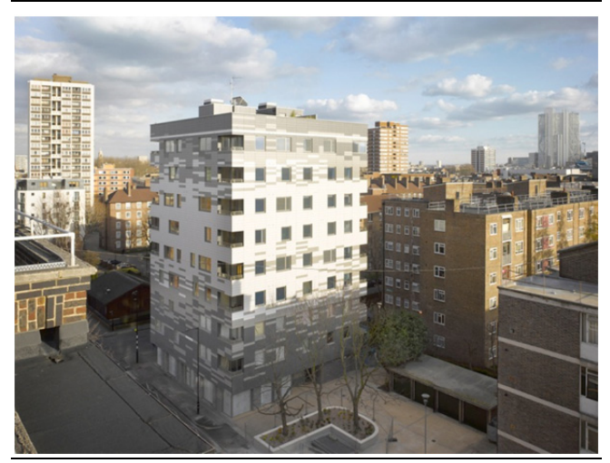
Note: The world's tallest modern timber residential building, "Murray Grove" (UK), 2009.