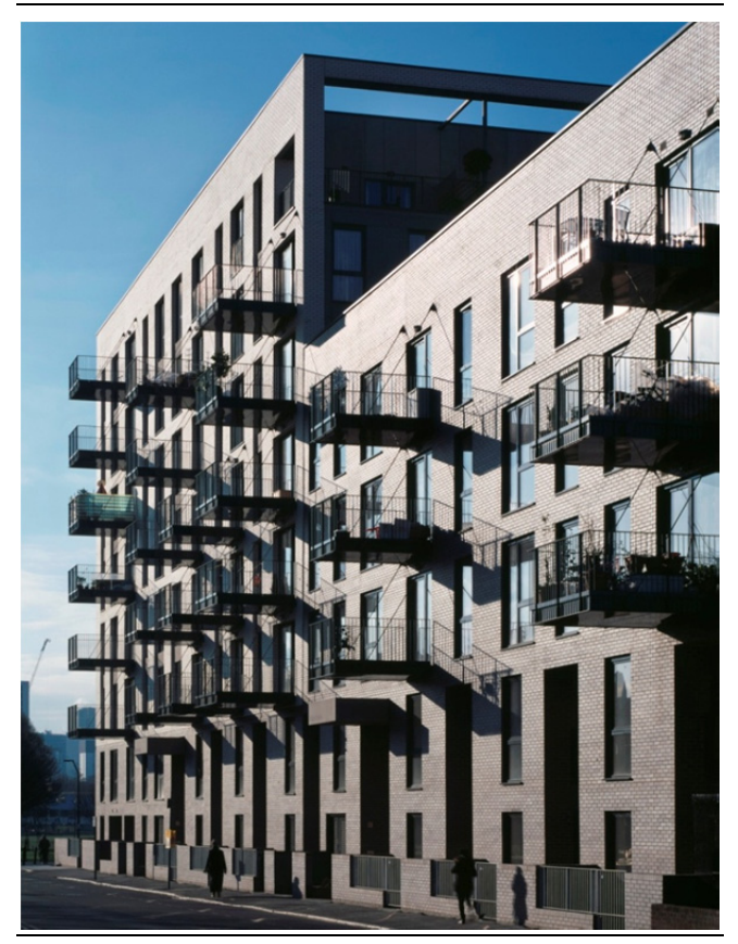
Note: 1,198 tonnes of stored CO<sub>2</sub> equivalent: the largest solid timber building in the UK, "Bridport House".

Despite their obvious advantages, take-up of these products has been uneven in the world construction market. The products are widely used in Austria, the UK, Switzerland, Germany and Italy. Austria is the market leader, and the UK and Germany show great potential in the short term. In the last five years, CLT production in Central Europe has grown by 20-30 % per year; and in 2011, 400,000 m<sup>3</sup> of CLT elements were produced in Austria, Germany, Italy and the Czech Republic – 70% of this in Austria (Plackner, 2012a, 2012b).