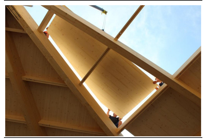
Note: Roof assembly with CLT boards on a glued laminated timber primary structure.