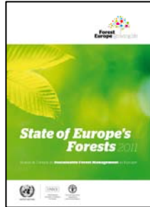
State of Europe Forests