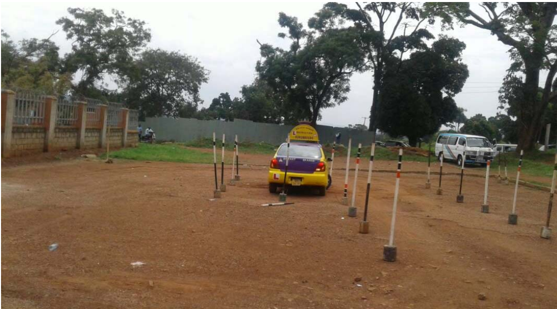
(Photo of a learner after successfully parking the vehicle in the Box)

Mr. Kugonza detailed the process of acquiring a driving permit and noted challenges such as lack of adequate testing institutions and testing materials, limited workforce, failure to roll out the curriculum for driving schools and the inconsistencies in the process.