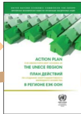
UNECE Action Plan