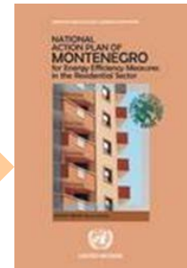
National Action Plan