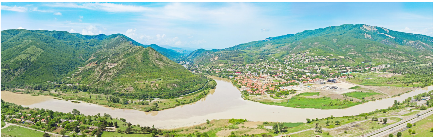
Confluence of Kura and Aragvi rivers in Mtskheta, Georgia

The EUWI National Policy Dialogues were presented at the seminar and the possibility to develop work on water data, statistics and information in this framework was discussed. It was proposed to consider sharing experience and best practices on water information and statistics in the framework of the NPDs.