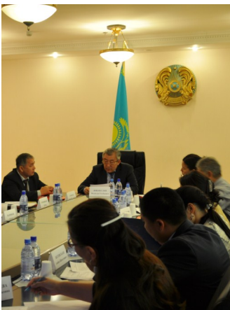
Intergovernmental meeting in Kazakhstan

A representative of Uzbekistan took part in the stakeholder meeting to learn about the experience of Kyrgyzstan in conducting the national policy dialogue. The Steering Committee on 24 October discussed the report