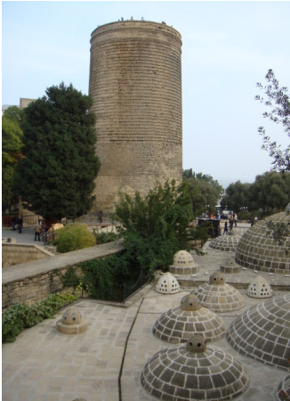
Maiden Tower Baku, Azerbaijan

The Steering Committee will regularly meet to prepare and review an Action Plan. This plan will be prepared by the working group in collaboration with all organizations in water sector. The objective of the plan will be achieving goals and short, medium and long term actions identified in the strategy. The plan will show how the future activities carried out in Azerbaijan will correspond to the local situation and will propose a number of priorities in addressing local needs.