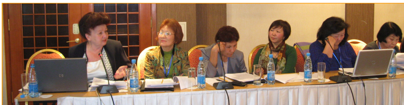
Stakeholders meeting in Kyrgyzstan (23 October 2012)

Dear colleagues, we would be happy to include your contributions in the next issues of this newsletter. Please send your contribution, up to 300 words, in English and/or Russian by 01/04/2013 to npd@unece.org . Photos are very welcome! Please also feel free to post your information on our Facebook page! Yours, EU Water Initiative NPD Team at UNECE