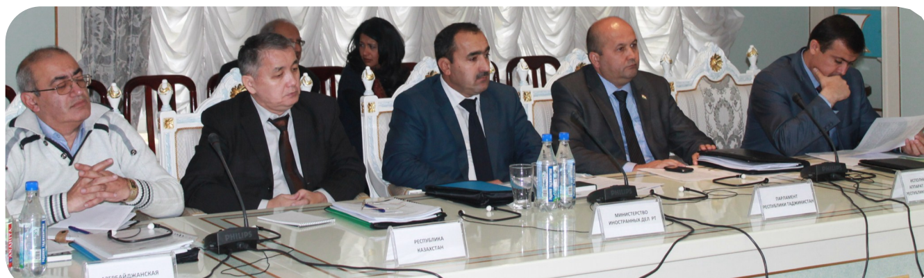
Representatives of Azerbaijan and Kazakhstan at the fourth Steering Committee meeting in Dushanbe, Tajikistan (15 November 2012)

NPD made it possible to create a general framework of the water sector reformation programme in Tajikistan