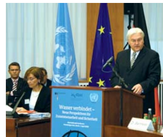
The German Federal Foreign Minister Steinmeier opens the conference 'Water Unites'

On 1 April 2008, the German Federal Foreign Minister announced the launch of a water initiative for Central Asia (the 'Berlin Process') at the Berlin water conference 'Water Unites'. The initiative is an offer by the German Federal Government to the countries of Central Asia to support them in water management and to make water a subject of intensified transboundary cooperation. The primary goal is to thereby set in train a process of political rapprochement in Central Asia that leads to closer cooperation in the use of the scarce water resources and may result in joint water and energy management in the long term.