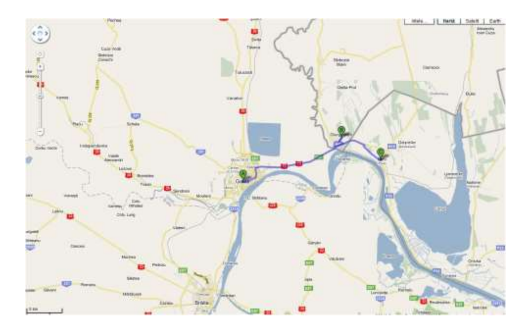
Figure 2 - The Danube Delta Region