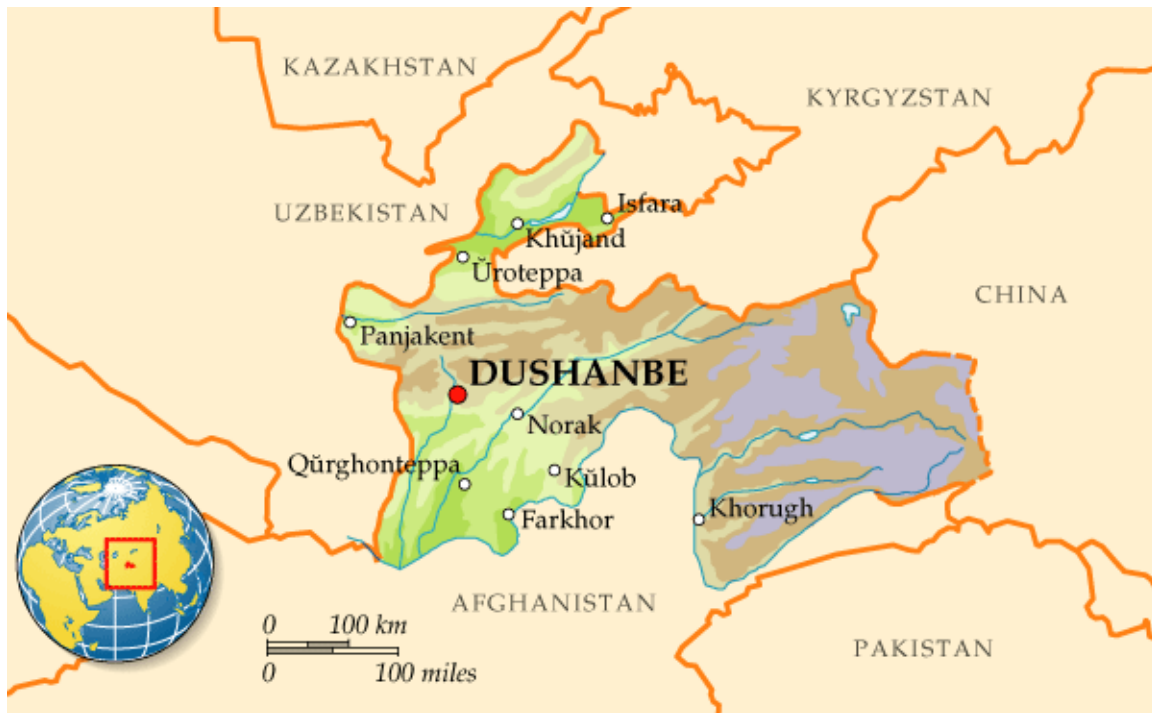
Figure 1 – Map of Tajikistan

The territory of the republic is 93% mountains and it is rich in mineral resources. However, the country's enormous natural resources did not fully serve the economy of the Republic but were involved in the general development scheme of the Soviet Union planned economy. Hence, the raw material orientation of the mining sector of Tajikistan was predetermined.