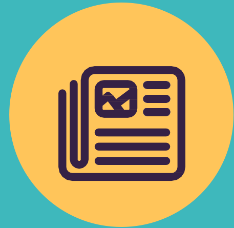
Country Profiles On Housing, Urban Development and Land Management