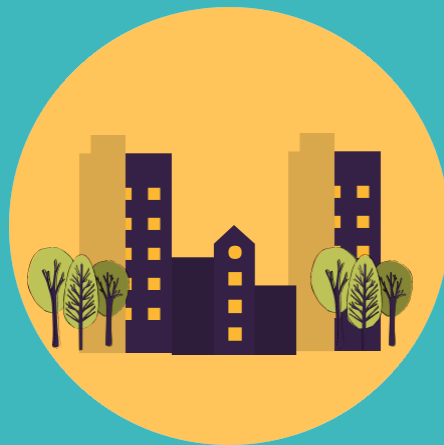
Sustainable Urban Development