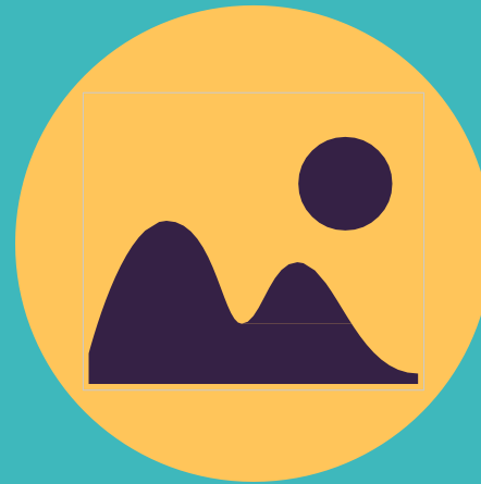
Land Administration And Management