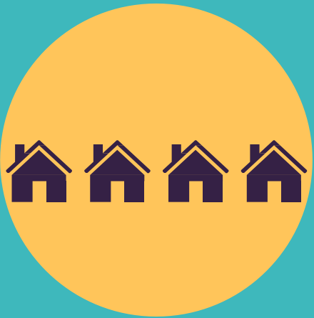
Sustainable Housing And Real Estate Markets