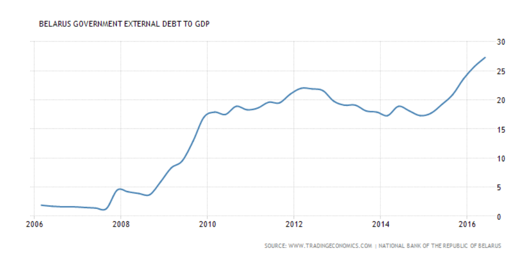
Fig. 2: Belarus Governmental External Debt to GDP (%).

Following the 2008 international financial crisis, the rising public debts of the governments and the contraction of international financial markets exerted additional pressure on state budgets. According to data from the National Bank of Belarus, the government's external debt ratio to GDP is significant, increasing from below 5% before 2008 to above 20% in 2012 and 25% in 2016 (see Fig. 2). The International Monetary Fund notes in the Country Report No. 13/18 – January 2014 that "the current account is worsening, coinciding with peak debt service, limited market access, and low reserves."